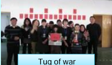
Tug of war