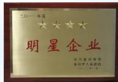
Changzhou City Start Enterprise