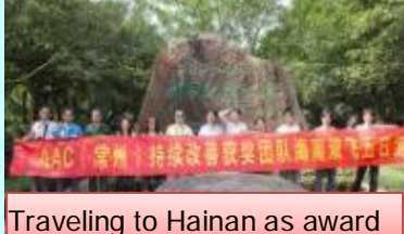
Traveling to Hainan as award