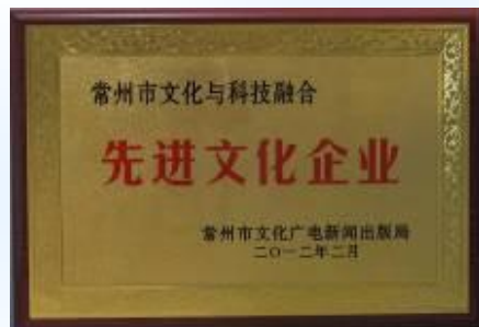
Leading Cultural Enterprise