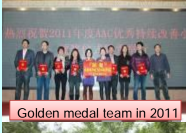
Golden medal team in 2011