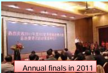
Annual finals in 2011

Focusing on “Quality improvement, increased efficiency, cost reduction and customer satisfaction”, AAC holds workshops to promoting learning, and innovation.