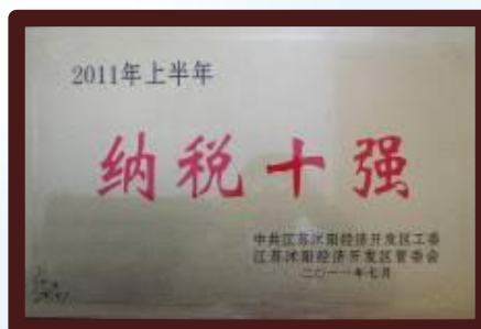
Shuyang Top Ten Taxpayers